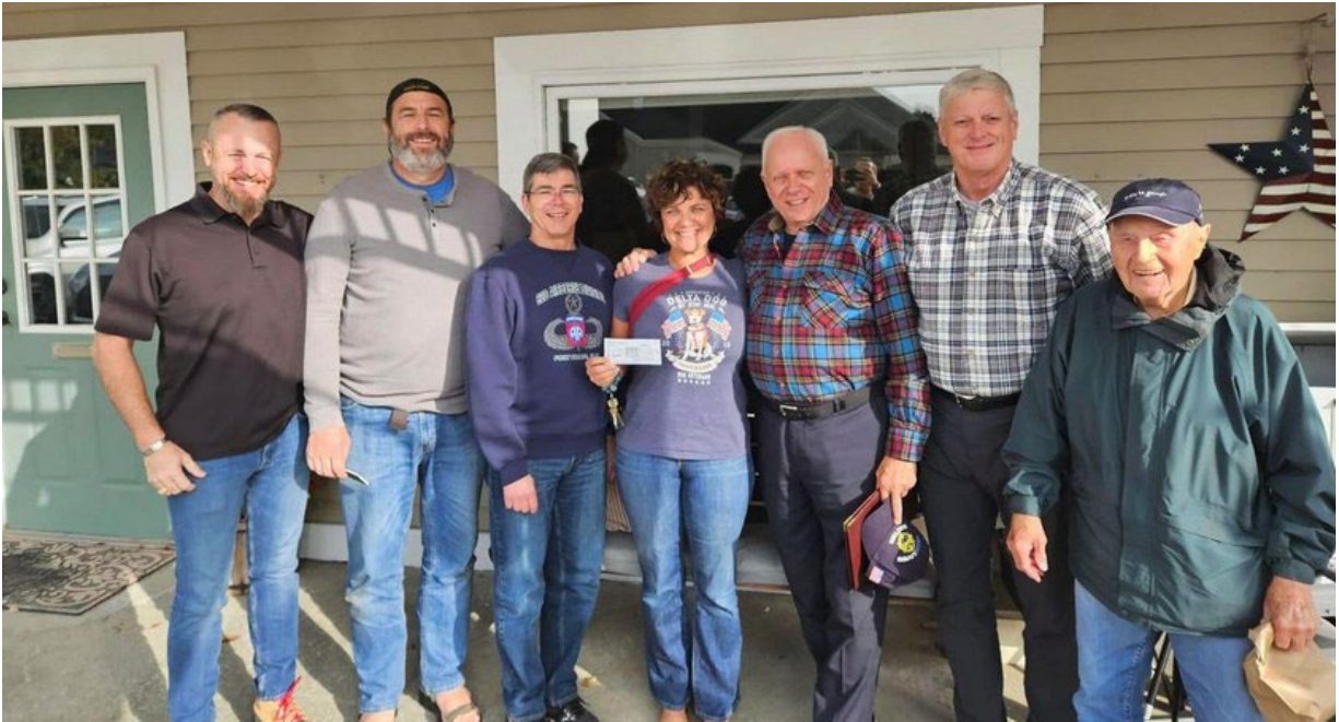
Presentation after Wednesday Veteran Breakfast

The Mission of Operation Delta Dog, as stated on their website ( https://operationdeltadog.org/ ), is “We rescue homeless dogs and train them to be service dogs for veterans living with Posttraumatic Stress Disorder (PTSD), Traumatic Brain Injury (TBI) and/or Military Sexual Trauma (MST).” A great cause the Post is proud to be a part of.